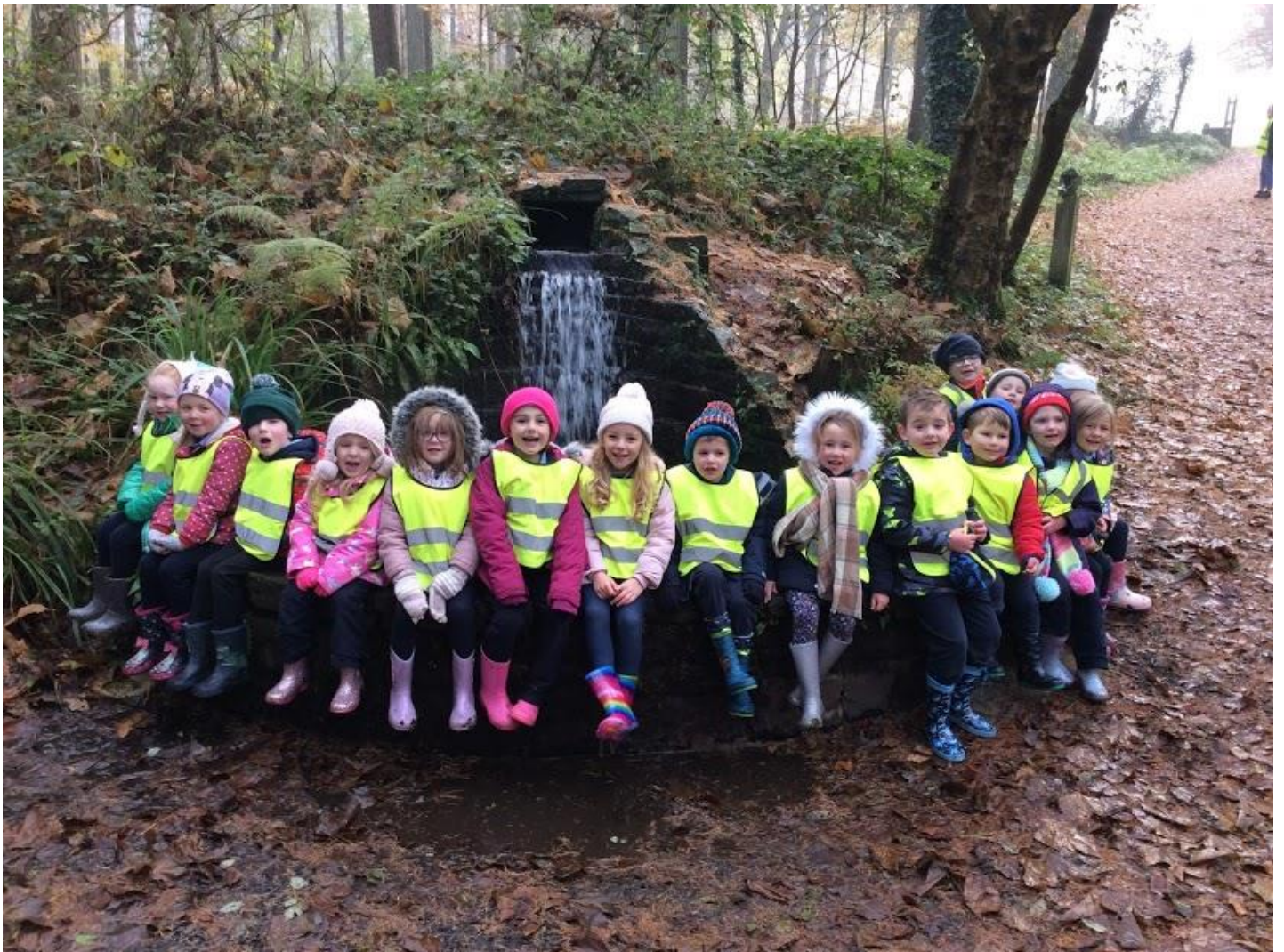
Our pupils visit Portglenone Forest for their autumn walk.